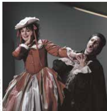
NEW ZEALAND OPERA 2010 MARRIAGE OF FIGARO.

Yes, it's long, but it's very engaging, and moves at a brisk pace.