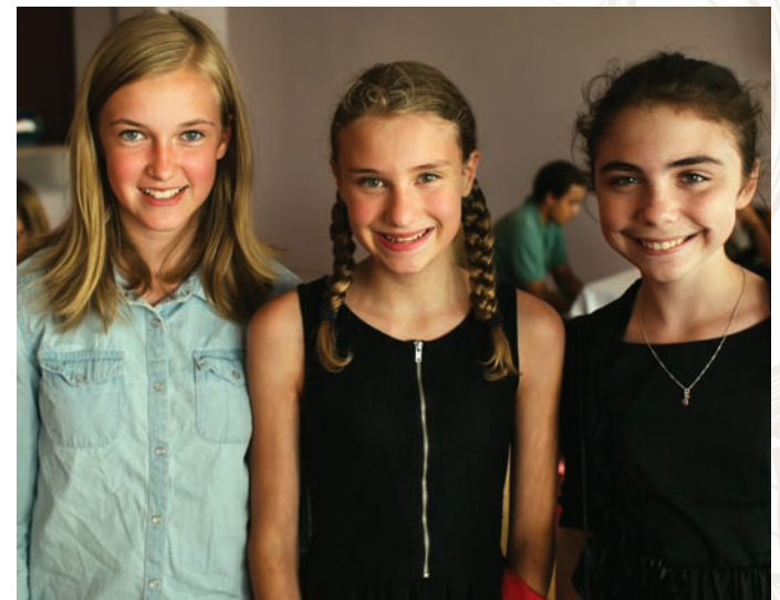
Die Walküre Dress Rehearsal.

For many, this was their first time seeing an opera.