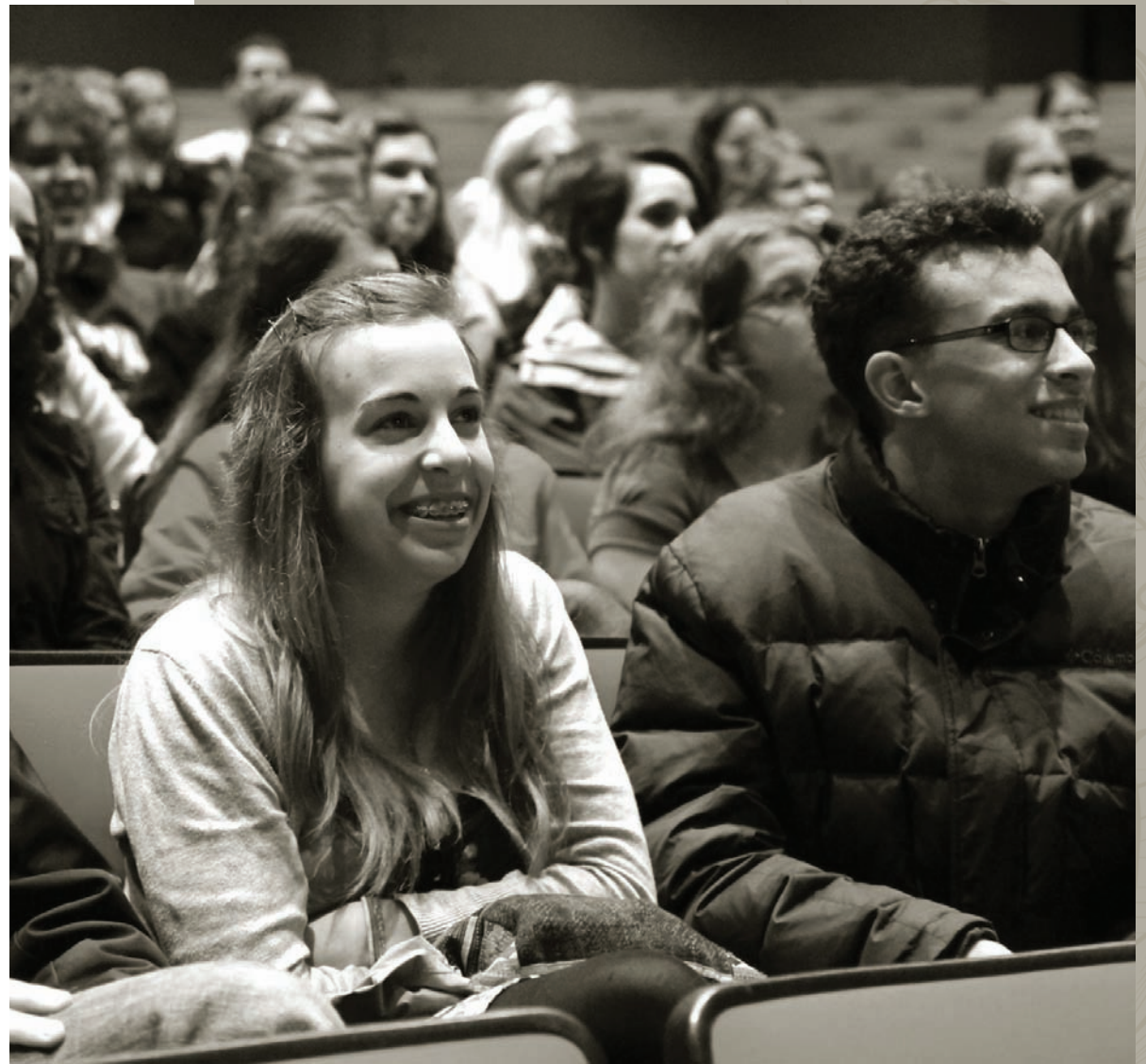
Experience Opera

The most telling sign of all: David's students started asking immediately if they could see another performance, outside of the school program. Their worlds had grown overnight – suddenly there was a whole new realm of opera they couldn't wait to explore.