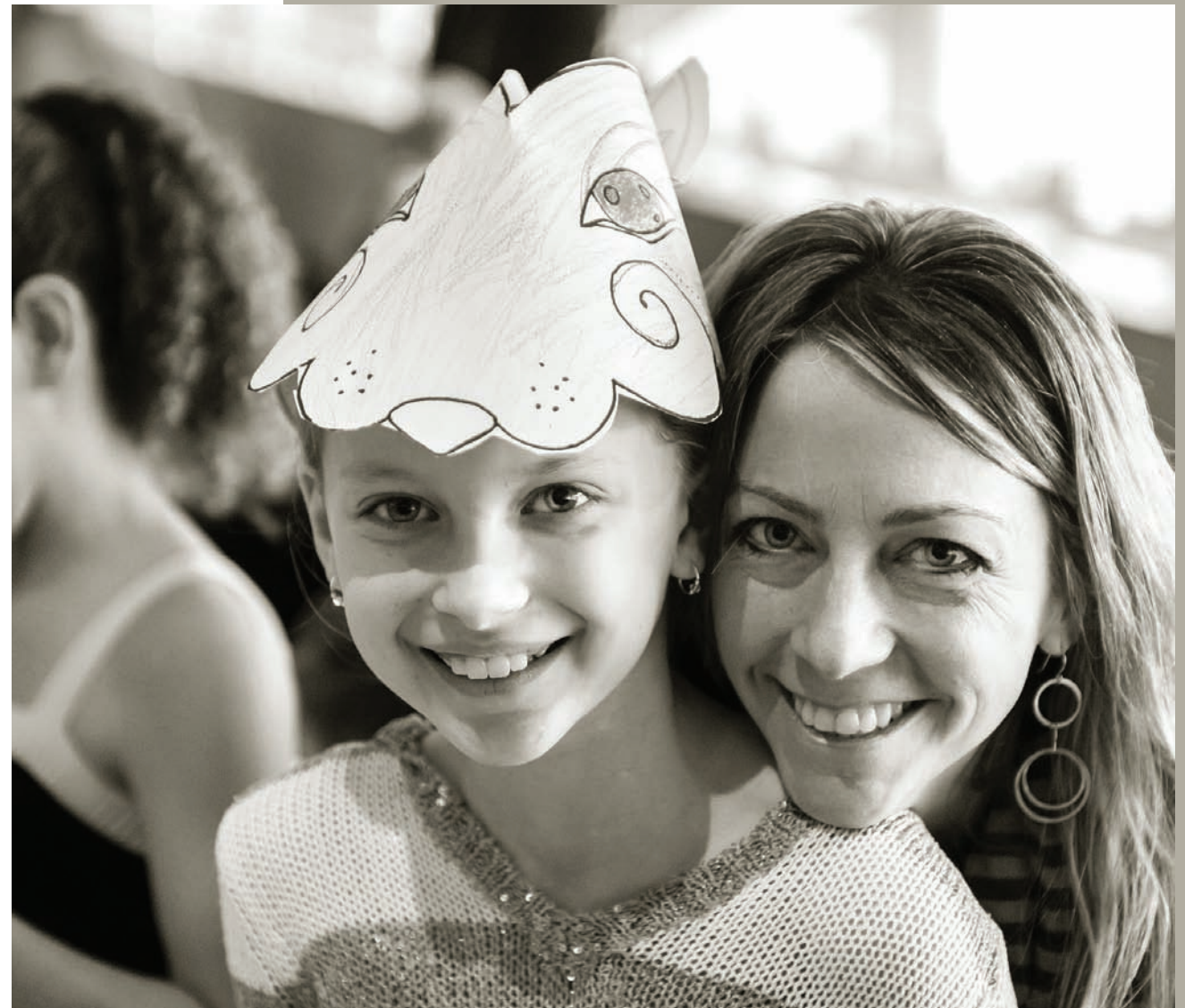
Cinderella Open House