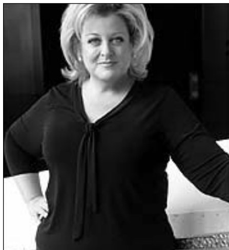
In March, '05 after she had gastric bypass surgery and lost 100 pounds.